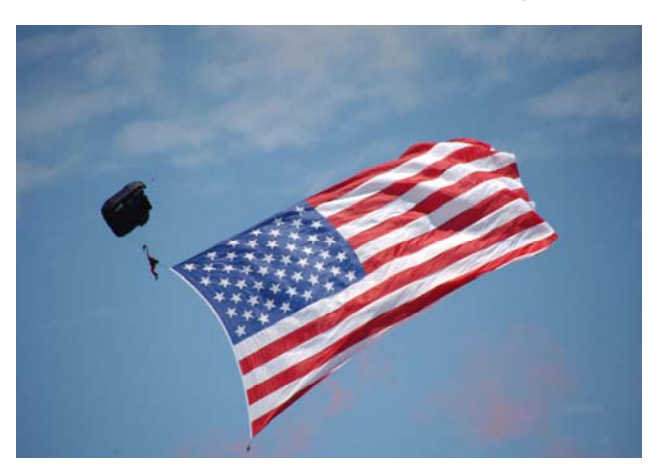
FREE - FREE - FREE - FREE - FREE

ONE WEEK ALL EXPENSES PAID, AIR VEN-TURE 2009, OSHKOSH, WI., FOR THE WINNER AND ONE GUEST.