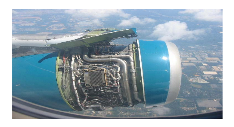
Failure To Follow Procedures Is The Number One Factor In Maintenance Related Aviation Accidents

Author: Lucky League - Air Salvage of Dallas